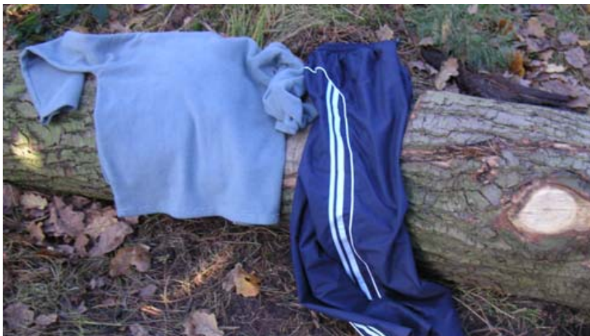
Synthetic clothes associated with accidents and fast descents