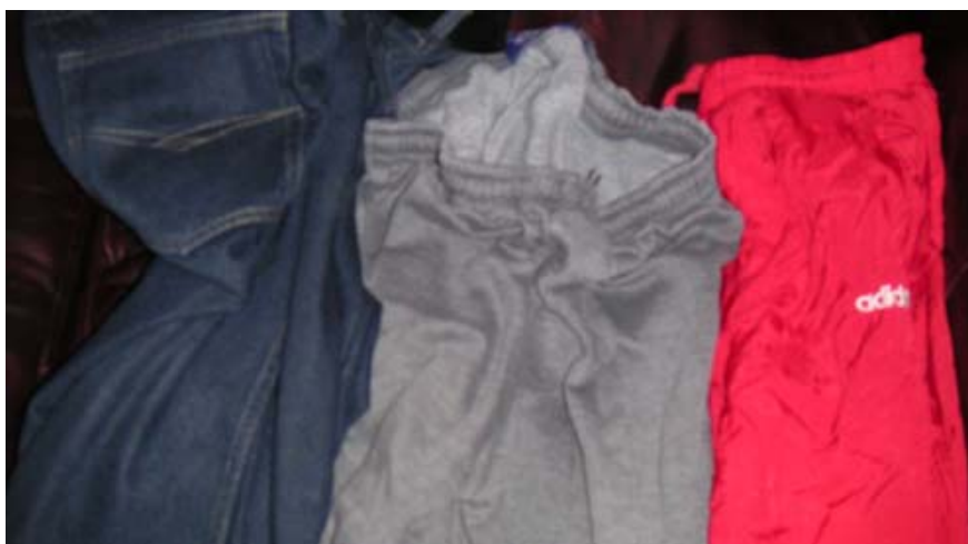
100% cotton denim 65%poly/cotton35% 100% Nylon Clothing used by consultant in tests